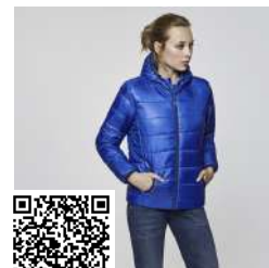
GROENLANDIA WOMAN RA5082