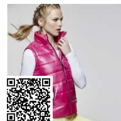
MONTANA WOMAN RA5084