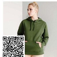
URBAN WOMAN SU1068