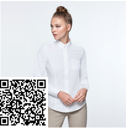
OXFORD WOMAN CM5068