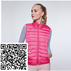
OSLO WOMAN RA5093