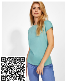
BREDA WOMAN CA6699